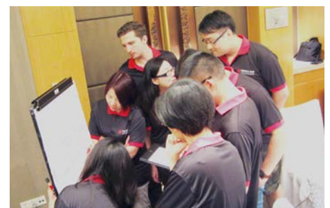
Putting our heads together