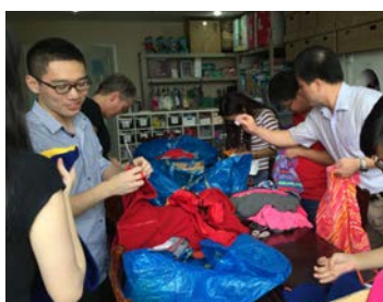
Fiducia's Shanghai team helping out at Yodak Hospital