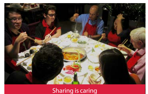
Sharing is caring