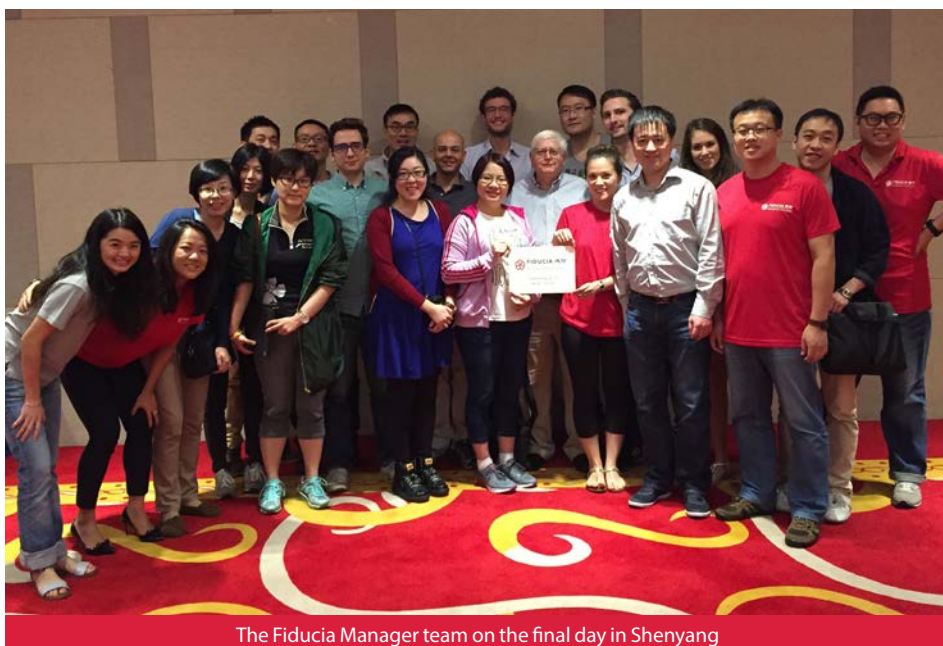
The Fiducia Manager team on the final day in Shenyang

We spent our third day together in the city of Shenyang in a series of internal workshops focused on updating our core processes. We wrapped up with a 'best ideas' session to open the floor to all team members. To see how new joiners and Fiducia veterans were able to come up with innovative suggestions was inspirational. Since then, we have successfully implemented many of these ideas, including the establishment of our Beijing office and the launch of our Cross Border Solutions. Without any doubt, these will benefit our clients greatly in 2016 and elevate Fiducia to the next level. ❁