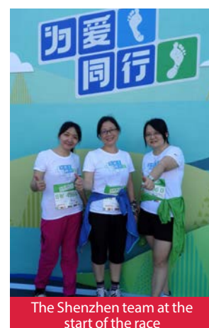
The Shenzhen team at the start of the race

Fiducia Shenzhen has continuously supported The One Foundation, a fully independent charity that focuses on disaster relief, children's welfare, and philanthropic development within the region. In June, the Fiducia Shenzhen team participated in the event “Walk For Love, 53KM hiking” organized by this charity, with the aim to raise funds for water purification in remote areas. It took our team 16 hours to accomplish this challenge, walking throughout the whole night. This is an unforgettable memory and I am proud that I was able to push myself to the limit while also giving back to the community at the same time. ☘