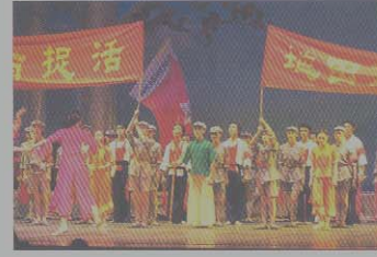
Ballet performance at Tongji's centenary celebration gala dinner, 28 th May 2007